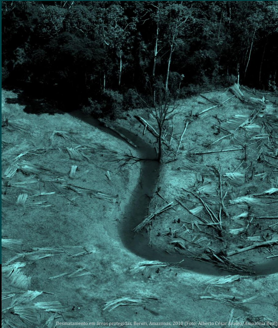
Desmatamento em áreas protegidas, Beruri, Amazonas, 2010