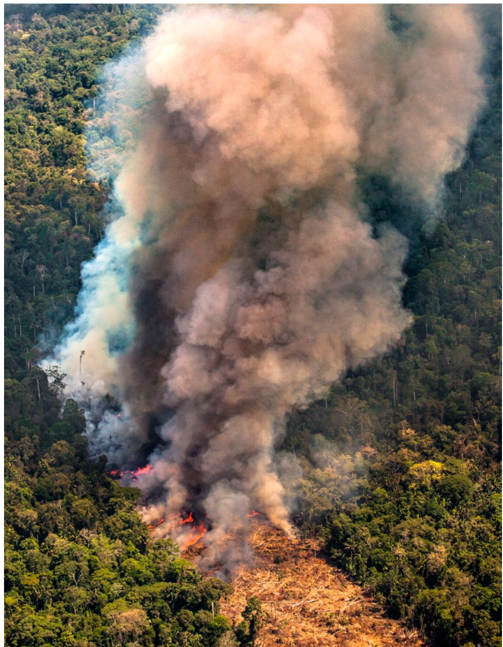
FIGURE 1: Wildfire in Anapú, Amazonas, Pará, Brazil, 2015.

threshold beyond which an ecosystem could shift abruptly to an alternative configuration; a tipping point could be driven by environmental conditions (e.g., rainfall) or ecosystem characteristics (e.g., tree coverage), and can be accelerated by feedback mechanisms. In the Amazon, crossing