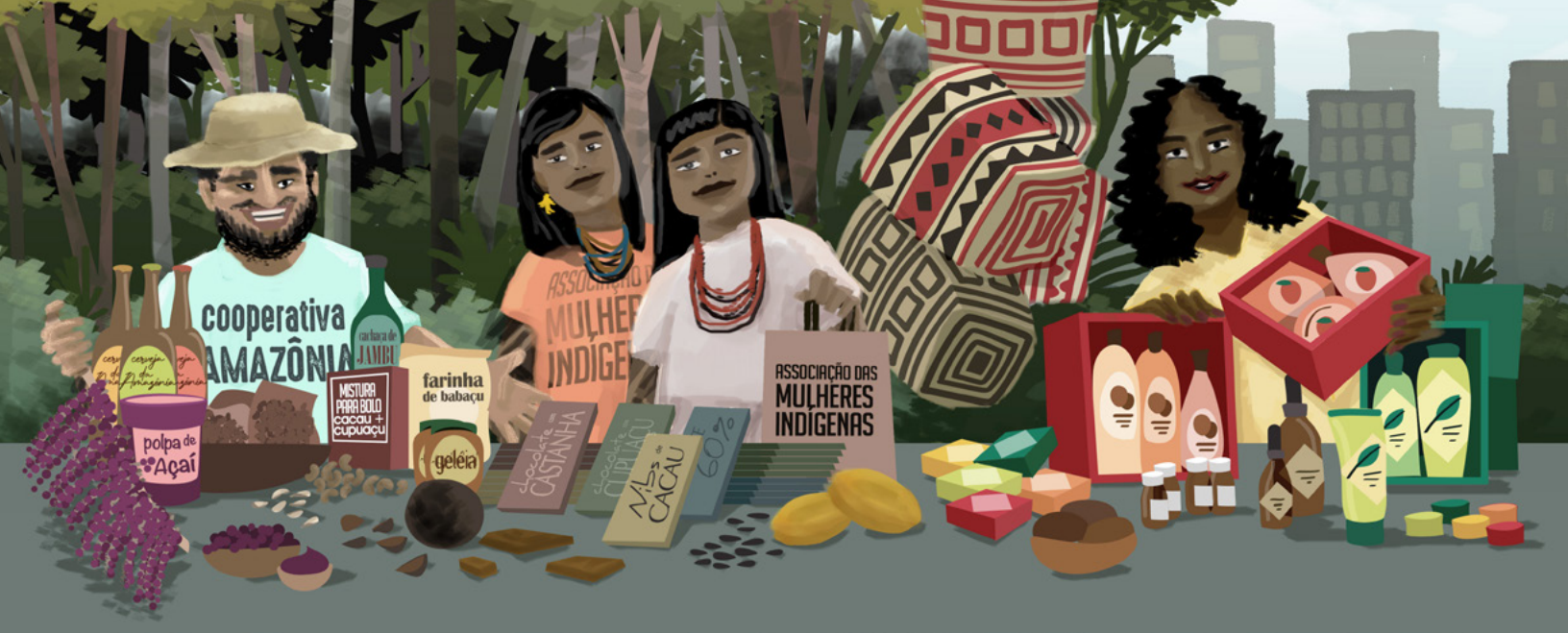
FIGURE 1: Sociobioeconomies based on sustainable use, cultural diversity, and economic and social value added to biodiversity in the Amazon region. Illustration: Dedê Paiva | www.dedepaiva.com.br