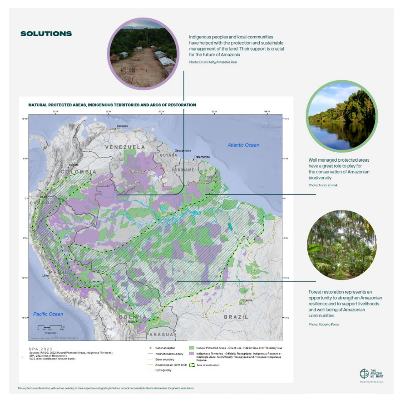
FIGURE 2. Solutions to avoid the Amazon tipping point include creating and maintaining Protected Areas and Indigenous Territories, as well as supporting large-scale restoration.

these forests is uncertain, as some areas may persist in a degraded state for decades or even centuries<sup>41-43</sup> as a consequence of positive feedbacks<sup>9</sup> (Box 2). Some examples are forests dominated by Vismia trees, bamboos, and lianas, which are expanding as a result of forest fires and other disturbances4<sup>4-46</sup>. Within agricultural frontiers, flammable alien grasses contribute to the spread of repeated fires, with at least 5% of landscapes in the southern Amazon maintaining an open-canopy degraded state<sup>47,48</sup>.