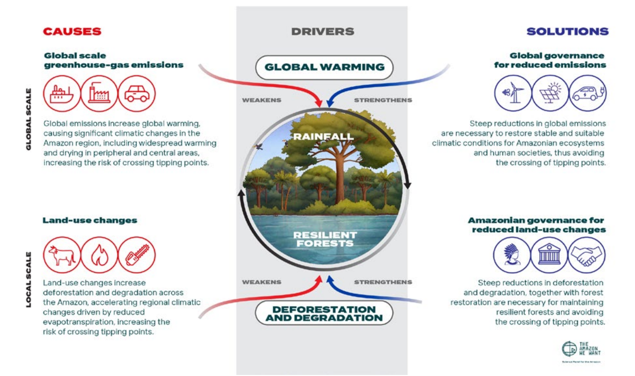
FIGURE 1. Causes, drivers, and solutions that affect the risk of reaching Amazon tipping points. The causes - greenhouse gas emissions and land-use changes - weaken the forest-rainfall feedback; i.e., forest loss contributes to climatic changes that further increase forest loss (Box 2), thus reducing forest resilience. The solutions - increased governance for reduced emissions and land-use changes - strengthen the forest-rainfall feedback, thus increasing forest resilience.

transitions. Tree mortality rates are increasing in most parts of the Amazon<sup>33</sup>, and droughtaffiliated tree species are becoming more abundant, changing forest composition and functioning<sup>34</sup>. Trees in the southern fringes of the Amazon are operating beyond their physiological thresholds (hydraulic-safety margin) in terms of water availability<sup>35</sup>. In floodplain forests, wildfires are facilitating the expansion of white-sand savanna ecosystems, with major shifts in the species of trees, birds, and fish<sup>36-38</sup>.